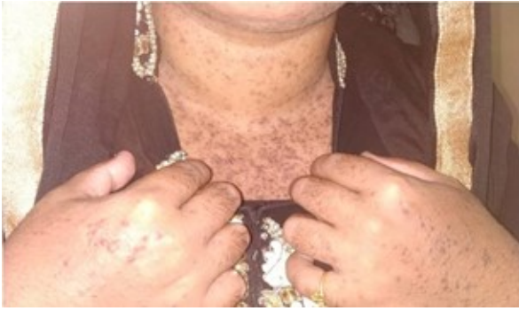
Figure.1. Hyperkeratotic dirty looking brown to black papules over the neck and dorsum of fingers

seborrheic dermatitis and the patient was given benzyl peroxide gel and calamine lotion for topical application. Her psychiatric conditions improved considerably, and she was discharged. After 3 weeks, during her follow up in the outpatient, it was found she had extensive skin manifestations for which review by the dermatologist was considered. On examination, there was hyperkeratotic brown to black papules of size 0.5×0.5 cm over the scalp margins, face, neck, upper