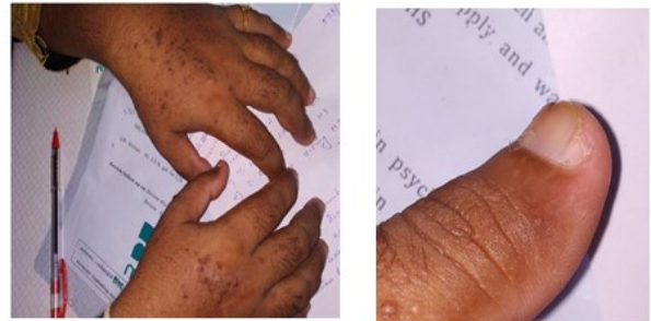
Figure.2. Fragile fingernails with longitudinal splitting and V-shaped nicking over the thumb

chest, bilateral axilla. Some lesions over the neck and retro-auricular area were greasy and dirty looking. Fingernails showed fragile, longitudinal splits with V-shaped nicking. Diagnosis of DD was considered. Lithium was stopped and proceeded with a skin biopsy. The patient was maintained on topical calamine lotion. The patient improved clinically. Her father had similar lesions, and the biopsy was consistent with DD.